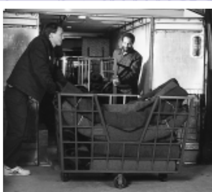
Burro Handtruck Standard Size