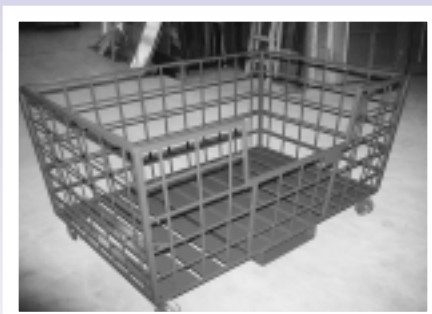
Burro Handtruck Oversized